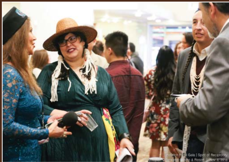
Potlatch Fund Gala | Spirit of Reciprocity Squamish Clearwater Casino & Resort | Nov 3, 2019

Potlatch Fund was formed in 2002 and is a Native-led 501(c)(3) nonprofit and leadership development organization. Among Northwest Coast tribes a potlatch is a ceremony of celebration, sharing, and giving. Potlatch Fund honors these traditional values and is dedicated to inspiring the Native tradition of giving by expanding philanthropy within Northwest Tribal Nations and communities. The Annual Gala is Potlatch Fund's major fundraising event and brings together people from many different tribes, organizations, corporations, and communities.