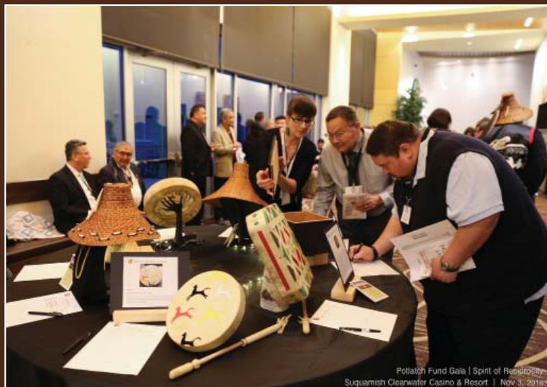
Potlatch Fund Gala | Spirit of Reciprocity Squamish Clearwater Casino & Resort | Nov 3, 2019