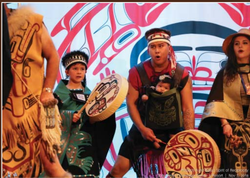
Potlatch Fund Gala | Spirit of Reciprocity Squamish Clearwater Casino & Resort | Nov 3, 2019