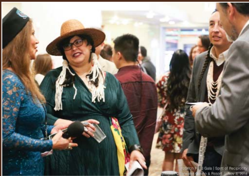
Potlatch Fund Gala | Spirit of Reciprocity Squamish Clearwater Casino & Resort | Nov 3, 2019

Potlatch Fund was formed in 2002 and is a Native-led 501(c)(3) nonprofit and leadership development organization. Among Northwest Coast tribes a potlatch is a ceremony of celebration, sharing, and giving. Potlatch Fund honors these traditional values and is dedicated to inspiring the Native tradition of giving by expanding philanthropy within Northwest Tribal Nations and communities. The Annual Gala is Potlatch Fund's major fundraising event and brings together people from many different tribes, organizations, corporations, and communities.