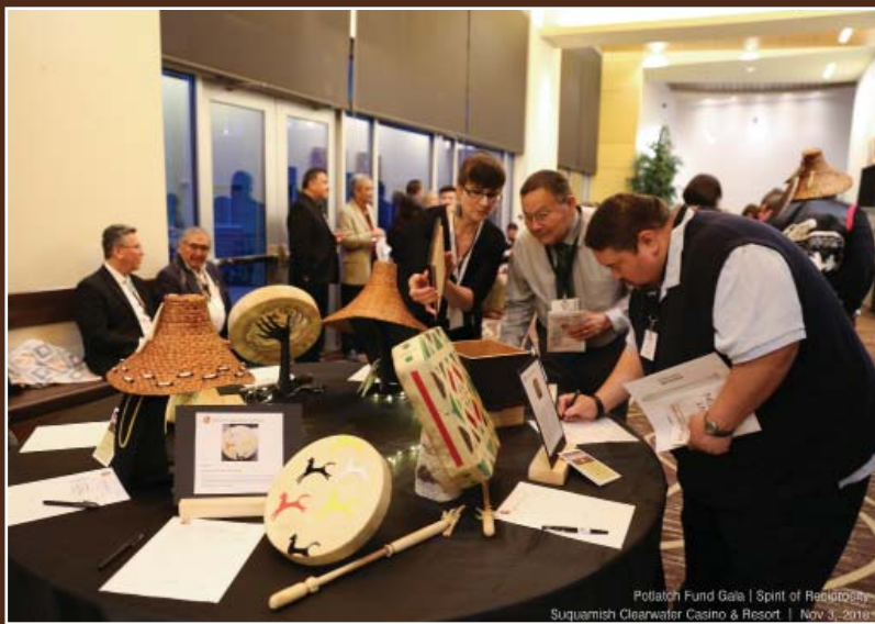
Potlatch Fund Gala | Spirit of Reciprocity Squamish Clearwater Casino & Resort | Nov 3, 2019